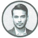
Atom Araullo FYT CO-FOUNDER AND BROADCAST JOURNALIST