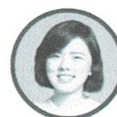
Dr. Beverly Lorraine Ho DEPARTMENT OF HEALTH DIRECTOR OF THE DISEASE PREVENTION AND CONTROL BUREAU AND THE HEALTH PROMOTION BUREAU