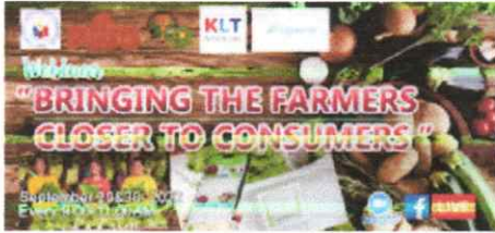
Webinar Logo ver1.jpg 452K