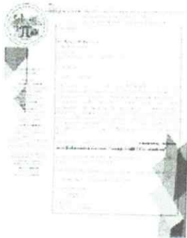
REGION X.JPG 192K

MECHANICS AND GUIDELINES 2023 3 CONTESTS.pdf 507K