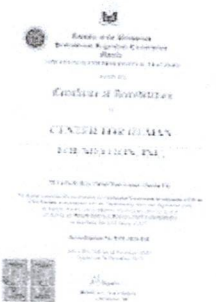
CDF Accreditation Certificate .jpg 829K

CHRDF Inc. Request for Advisory (Teach).pdf 212K